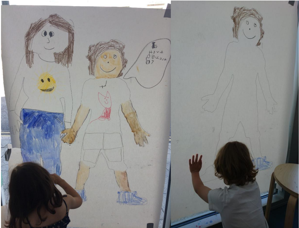
You can stick your portrait onto a wall with tape or work on the floor if you have the space.