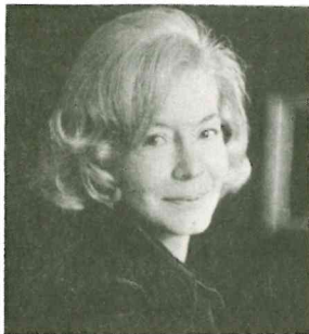
Nina Bawden

Jan Pienkowski , author of the famous 'pop-up' books Robot and The Haunted House as well as the 'Meg & Mog' series, who will be inviting children to join him in painting a large mural to be exhibited permanently at the Arts Centre. (Bring old clothes, overalls or an apron).