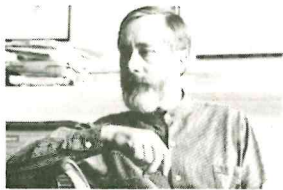
Alan Sillitoe

Alan Sillitoe reads some of his short stories and poems.