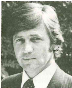
Melvyn Bragg

Melvyn Bragg was born in Wigton, Cumberland in 1939. He was educated locally and at Oxford, where he read Modern History. Since then he has made his living as a novelist and broadcaster.