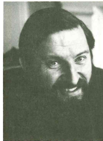
H.R.F. Keating

H.R.F. Keating is a crime writer and a novelist who has been crime book critic for The Times since 1967. He has twice won the Gold Dagger of the Crime Writers Association, most recently for The Murder of the Maharajah (Collins/Hamlyn) and in 1964 for the first of his 'Inspector Ghote' novels, The Perfect Murder (Collins/Hamlyn). His most recent book is Go West, Inspector Ghote (Collins). He is also the author of Sherlock Holmes, The Man and his World (Thames & Hudson) and he edited Agatha Christie: First Lady of Crime (Weidenfeld & Nicholson). Due in the autumn of 1982 is The Book of Crime and Suspense Fiction , a guide to mystery writing and mystery writers.