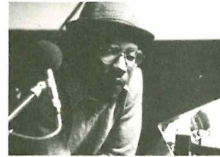
Linton Kwesi Johnson

Linton Kwesi Johnson was born in 1952 in Chapleton, Jamaica and came to Britain in 1963. He started publishing poetry in the early 70's and in 1977 he was awarded the C. Day Lewis Fellowship as Writer-in-Residence in the Borough of Lambeth. His