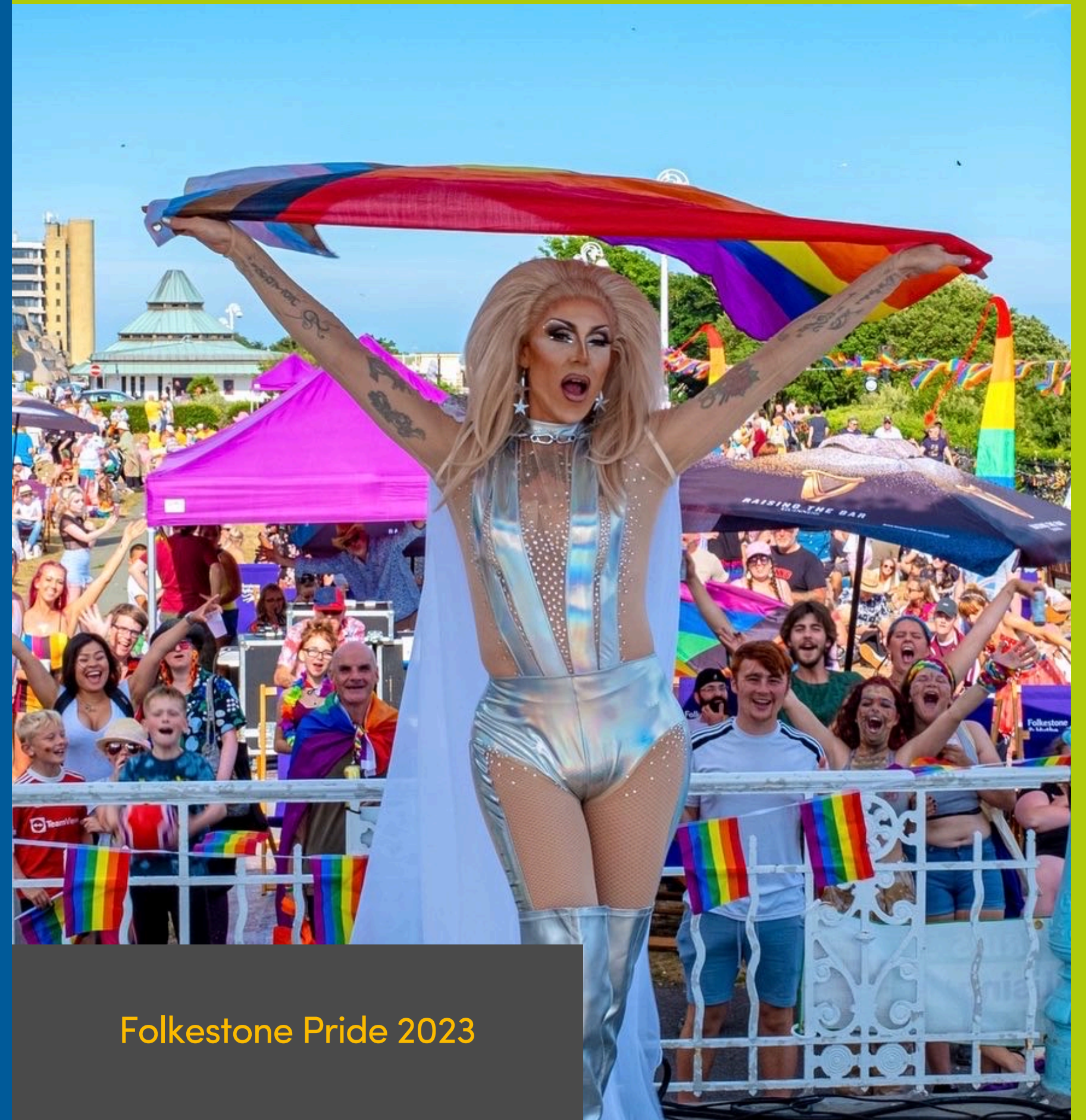
Folkestone Pride 2023